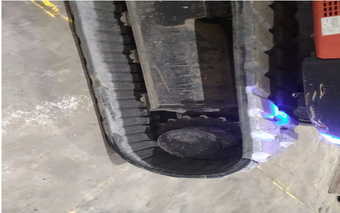
Tyre Condition 4

Australian Hammer Supplies Hire Unit 3/32 Williamson Road Ingleburn NSW 2565